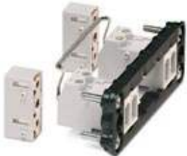
Panel mounting frame, with capacitive PE, for contact insert modules, type 4, number of insert modules 5

Please be informed that the data shown in this PDF Document is generated from our Online Catalog. Please find the complete data in the user's documentation. Our General Terms of Use for Downloads are valid ( http://phoenixcontact.com/download )