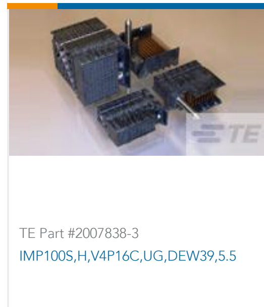
TE Part #2007838-3 IMP100S,H,V4P16C,UG,DEW39,5.5