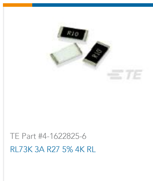
TE Part #4-1622825-6 RL73K 3A R27 5% 4K RL