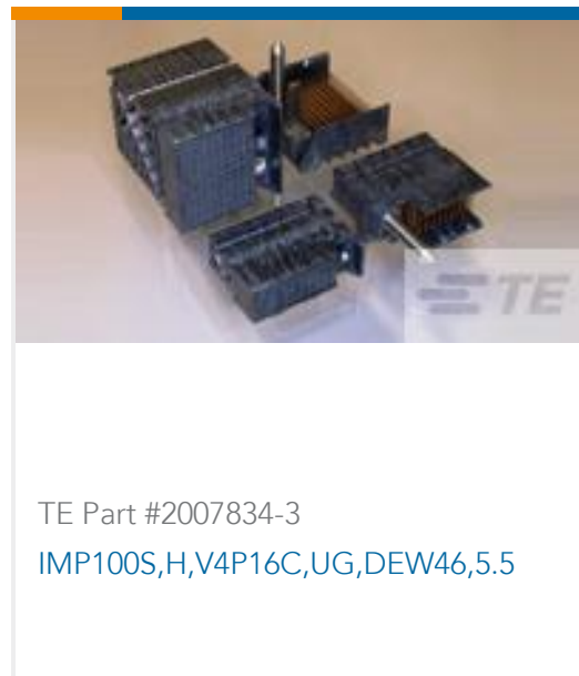
TE Part #2007834-3 IMP100S,H,V4P16C,UG,DEW46,5.5