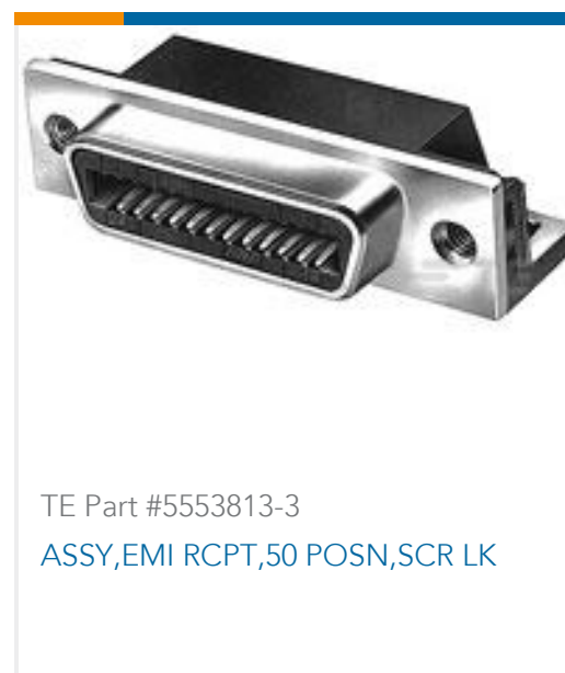
TE Part #5553813-3 ASSY,EMI RCPT,50 POSN,SCR LK