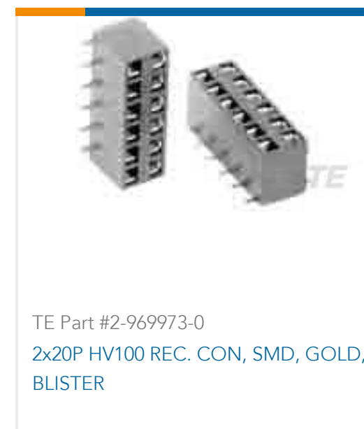
TE Part #2-969973-0 2x20P HV100 REC. CON, SMD, GOLD, BLISTER