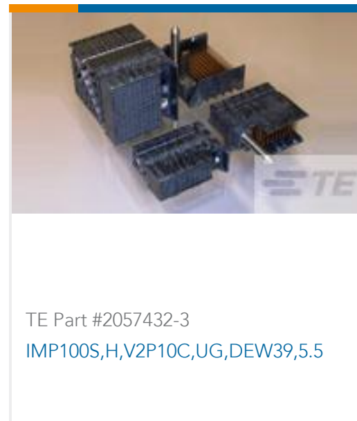
TE Part #2057432-3 IMP100S,H,V2P10C,UG,DEW39,5.5