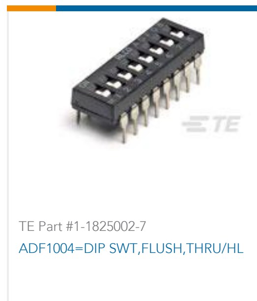
TE Part #1-1825002-7 ADF1004=DIP SWT,FLUSH,THRU/HL