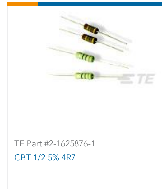
TE Part #2-1625876-1 CBT 1/2 5% 4R7