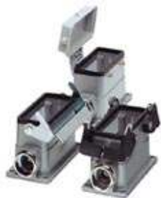
HEAVYCON box mounting base HV6, with double locking latch, height 67 mm, with support 1xM25

Please be informed that the data shown in this PDF Document is generated from our Online Catalog. Please find the complete data in the user's documentation. Our General Terms of Use for Downloads are valid ( http://download.phoenixcontact.com )