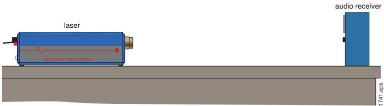
Figure 1. Side view of the laser and audio receiver.