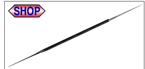
Stainless Steel Straight Probe