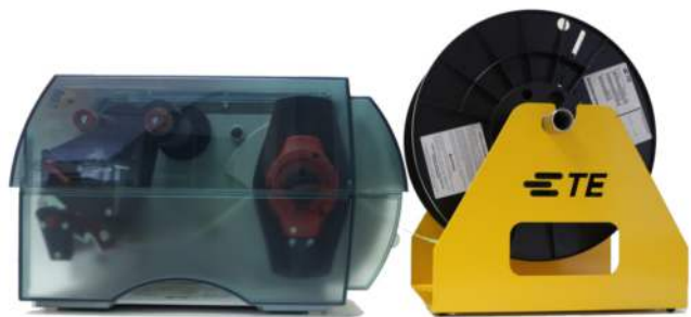
TE3124 with Universal REEL HOLDER