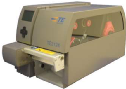
TE3124 fitted with, metal cover and Cutter/Perforator