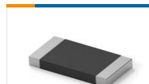
TE Part #3-2176422-1 TLRP 2512 3.0W R047 1% 25PPM 4K RL