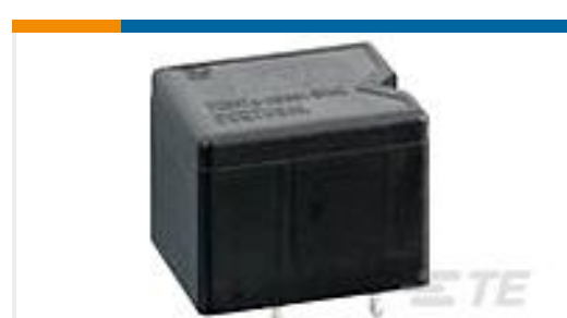
TE Part #1393277-4 V23076A1001C133