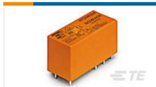
TE Part #1-1393243-0 RTE24024