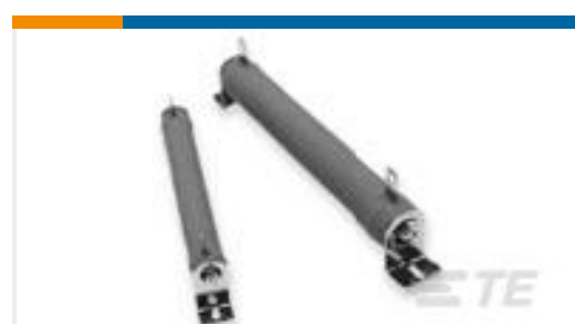
TE Part #1879457-1 TE 2500W 1R0 5% Bracket