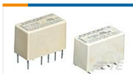
TE Part #1-1393788-6 V23079A1005B301