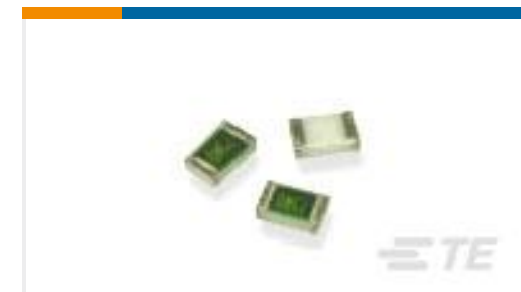
TE Part #3-2176092-3 RP 2A 0.25W 1K5 0.1% 25PPM 1K RL