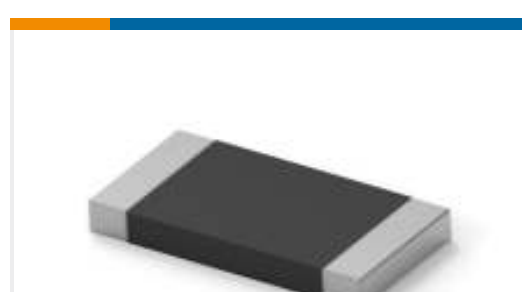
TE Part #5-2176422-6 TLRP 2512 3.0W R015 1% 50PPM 4K RL