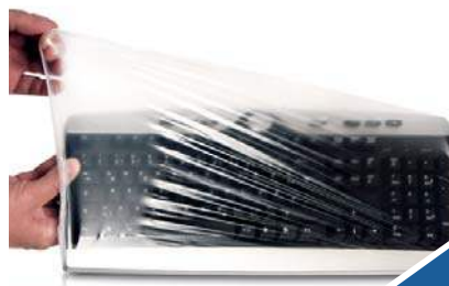
2. Pull the foil over the keyboard