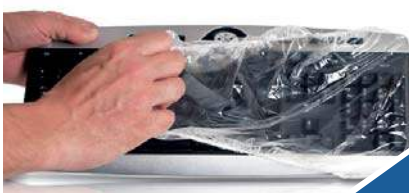
1. Apply Keyboard Cover