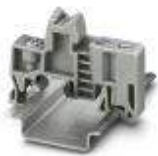
End clamp, for assembly on NS 32 or NS 35/7.5 DIN rail