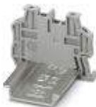
Quick mounting end clamp for NS 35/7,5 DIN rail or NS 35/15 DIN rail, can be fitted with ZB 5 and ZBF 5 zack marker strip, KLM 2, KLM3, and KML3L terminal strip marker, parking option for FBS...5, FBS...6, KSS 5, KSS 6, width: 5.15 mm, color: gray