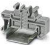
Snap-on end bracket, for 35 mm NS 35/7.5 or NS 35/15 DIN rail, can be fitted with Zack strip ZB 8 and ZB 8/27, terminal strip marker KLM 2 and KLM, width: 9.5 mm, color: gray