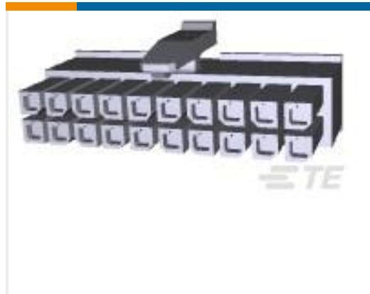
TE Part #2-794617-0 20POS,MICRO MNL,RCPT HSG