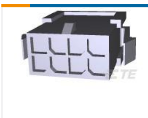
TE Part #794615-8 PANEL MT DBL ROW HSG 8 POS