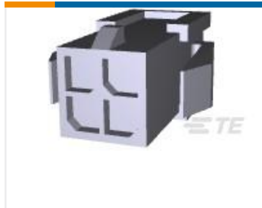
TE Part #794615-4 PANEL MT DBL ROW HSG 4 POS