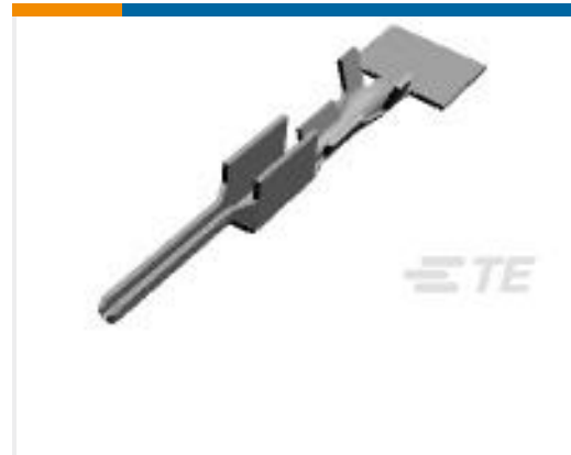
TE Part #1-794609-1 PIN CONT 26-30 15 GOLD STRIP