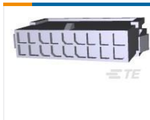
TE Part #1-794615-8 PANEL MT DBL ROW HSG 18 POS