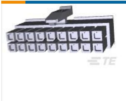
TE Part #1-794617-8 18POS,MICRO MNL,RCPT HSG