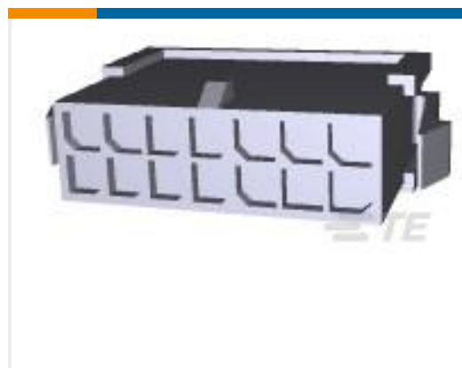
TE Part #1-794615-4 PANEL MT DBL ROW HSG 14 POS