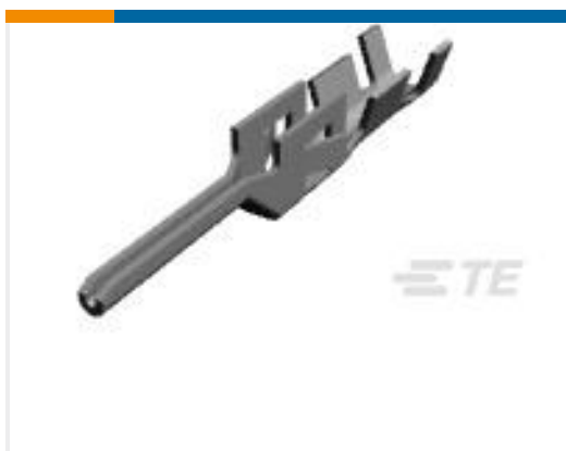
TE Part #1-794612-1 PIN CONT 20-24 15 GOLD L/P