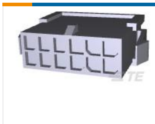
TE Part #1-794615-2 PANEL MT DBL ROW HSG 12 POS