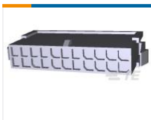
TE Part #2-794615-2 PANEL MT DBL ROW HSG 22 POS