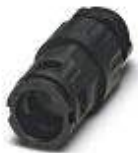
Cable gland, metric thread, IP68/69k protection, with strain relief

Screw connection - WP-GR HF IP69K M25 BK - 3240941