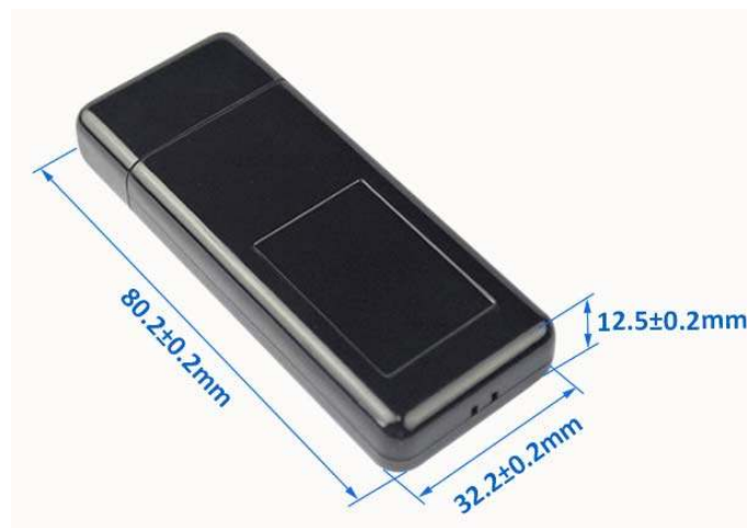
Fig. 2: Overall Dimensions of BDE-USB216

Fig. 2 shows the overall dimensions of BDE-USB216. The USB dongle measures 80.2 mm long by 32.2 mm wide by 12.5 mm high.