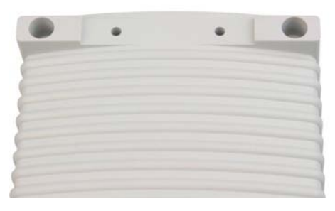
Screwing of the enclosure half-shells is from below, so the screws cannot be seen on the operating surface.