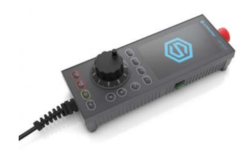
The enclosure has a recessed operating surface with a lot of space for the installation of switches and signalling elements.