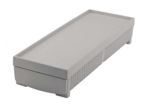
The material and design make this sturdy enclosure ideal for use in rough operating conditions.