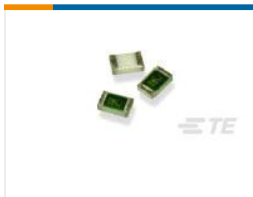
TE Part #1879417-8 CPF0603 1M0 0.1% 25PPM 5K RL