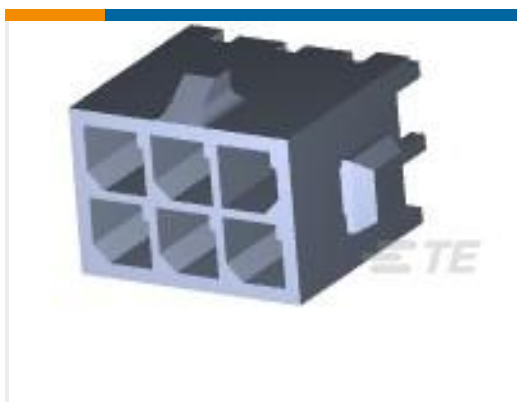
TE Part #3-794630-6 06P MICRO MNL ASSY VRT HDR LF