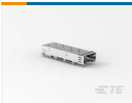
TE Part #2274001-1 ZSFP+ 1X1 CAGE ASSEMBLY PRESSFIT