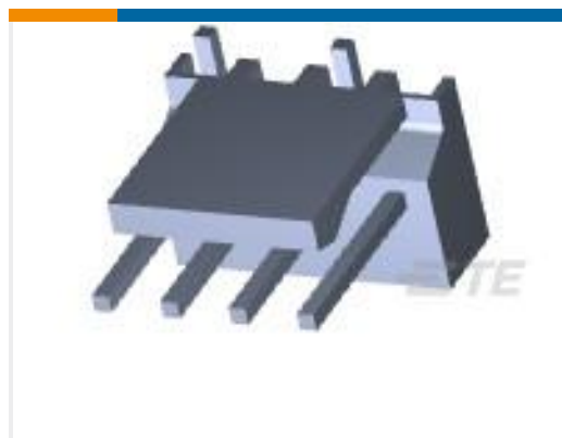
TE Part #3-647166-4 4P MTA100 HDR ASSY,SM,FL,LF