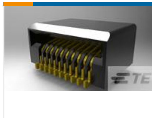
TE Part #2170088-2 ZSFP+ Connector,15u"