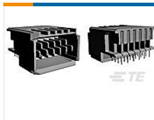
TE Part #5646954-1 UPM EXPANDED PIN, RA 4P ASSEMBLY