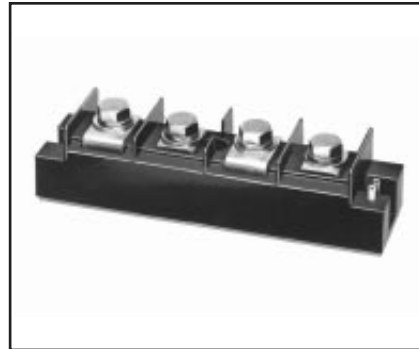
CM530820 Dual SCR POW-R-BLOK™ Modules 200 Amperes/800 Volts