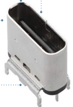
USB4 Type-C Receptacle, Vertical, 24 Circuit (204711 Series)