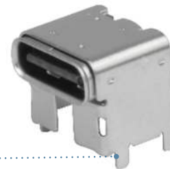
USB 2.0 Type-C Receptacle, Top-Mount, High-Center, 16 Circuit (217180 Series)

Is helpful in aligning high-center line positions