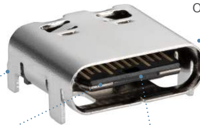
USB4 Type-C Receptacle, Top-Mount, 24 Circuit (105450 Series)

Provides space savings and design flexibility