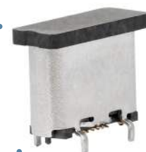
USB 2.0 Type-C Receptacle, Vertical, 16 Circuit (217182 Series)