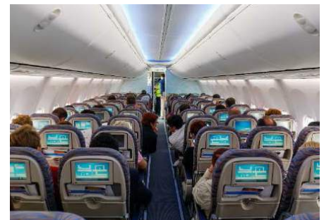
In-Flight Entertainment Systems