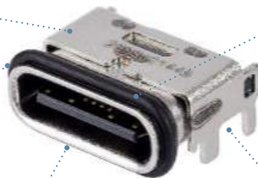
USB 2.0 Type-C Receptacle, 16 Circuit (213083 Series)

Provides protection against dust and water ingress