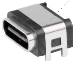
USB Type-C Receptacle, 6 Circuit (217176 Series)

Provides protection against dust and water ingress