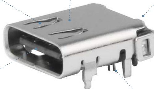
USB 3.2 Type-C Receptacle, Top-Mount, 24 Circuit (217183 Series)

Top-mount and mid-mount USB 3.2 type-c receptacles Offer design flexibility