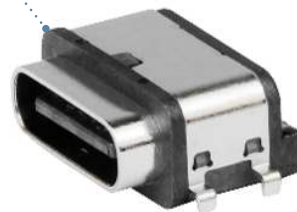
USB Type-C Receptacle, 6 Circuit (217177 Series)