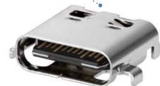
USB4 Type-C Receptacle, Mid-Mount, 24 Circuit (105455 Series)