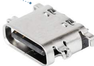
USB 2.0 Type-C Receptacle, Mid-Mount, 16 Circuit (216990 Series)