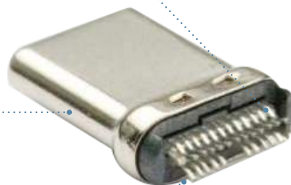
USB4 Type-C plug, 24 Circuit (105444 Series)