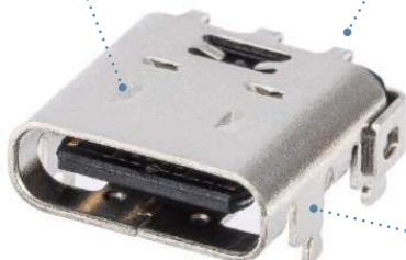
USB 2.0 Type-C Receptacle, Top-Mount, 16 Circuit (213716 Series)

Metal shell Provides strength/robustness to the connector