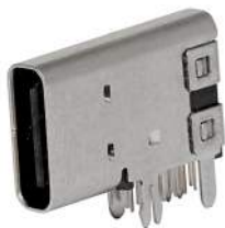
USB Type-C Receptacle, Upright, 14 Circuit (216989 Series)