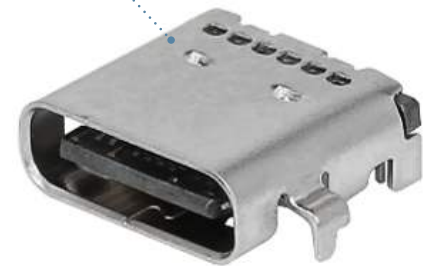
USB 3.2 Type-C Receptacle, Mid-Mount, 24 Circuit (217184 Series)