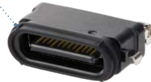
USB 3.2 Type-C Receptacle, 24 Circuit (202410 Series)