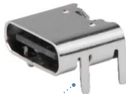
USB Type-C Receptacle, Top-Mount, 6 Circuit (217175 Series)

Long receptacle housing leads Is suitable for different PCB thicknesses to provide stable PCB connections