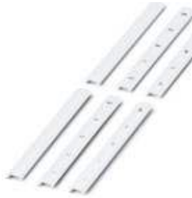
Zack Marker strip, flat, Strip, white, Unlabeled, Can be labeled with: Plotter, Mounting type: Snap into flat marker groove, Lettering field: 15 x 5.2 mm

Please be informed that the data shown in this PDF Document is generated from our Online Catalog. Please find the complete data in the user's documentation. Our General Terms of Use for Downloads are valid ( http://download.phoenixcontact.com )