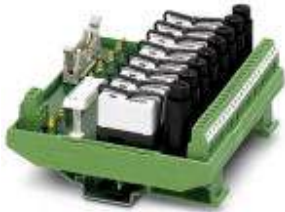
VARIOFACE output module, with 8 miniature relays, 1 PDT and fuse each, plugged, for 24 V DC (incl. relay)

Please be informed that the data shown in this PDF Document is generated from our Online Catalog. Please find the complete data in the user's documentation. Our General Terms of Use for Downloads are valid ( http://phoenixcontact.com/download )