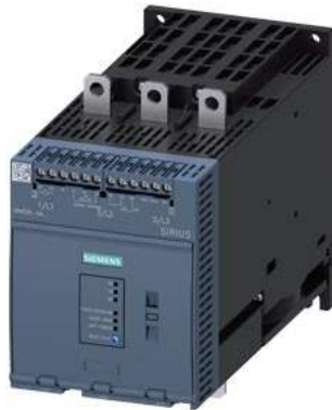
SIRIUS soft starter 200-600 V 171 A, 110-250 V AC Screw terminals Analog output