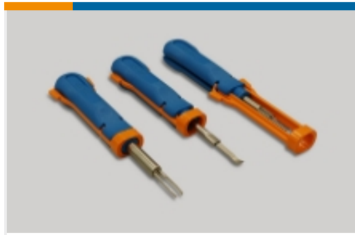
Insertion & Extraction Tools(5)