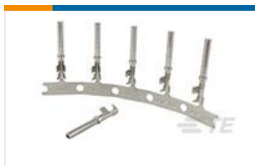
TE Part #1062-20-0222 SOC, SF, SIZE 20, 16-22, NI/NI