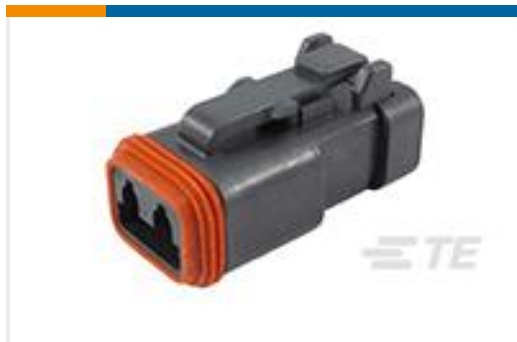
TE Part #DT06-2S-CE05 PLG, 2P, BLK, E, SEAL RET, CAP