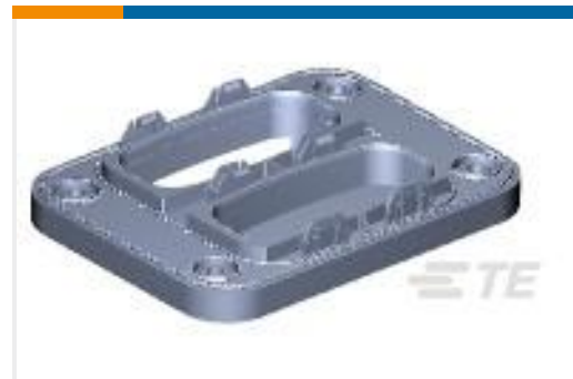
TE Part #1813123-2 ASSY FOR SUPPORT PLATE AND SEALING