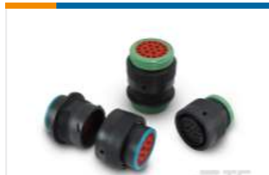
TE Part #HDP26-18-14SE DEUTSCH HDP20 Housings