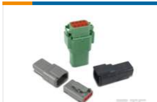
TE Part #DTM04-3P-E003 DEUTSCH DTM Housings