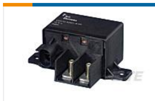
TE Part #1416010-1 V23132A2001B200