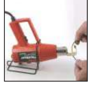
Bench Stand To position heat guns for various applications Part No. 35216