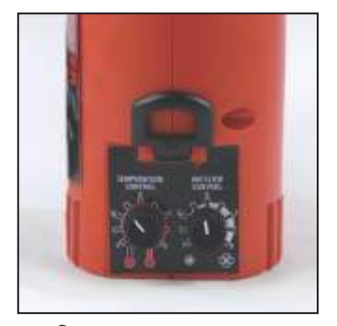
Separate temperature and airflow controls