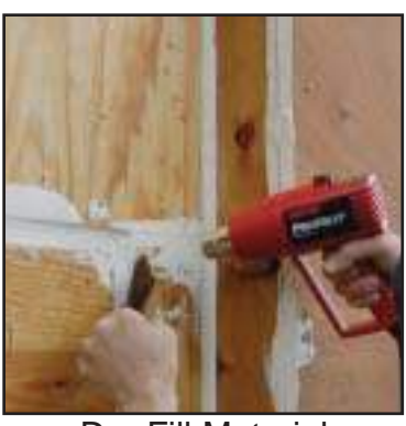
Dry Fill Material