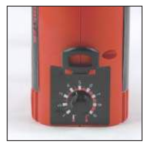
Easy access heat control