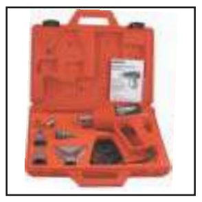
Storage Case Transport and storage in a rugged plastic case Part No. 35351