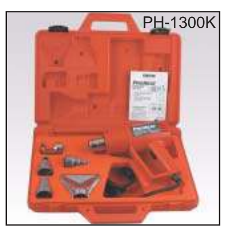
Rugged storage case with 5 specialty attachments