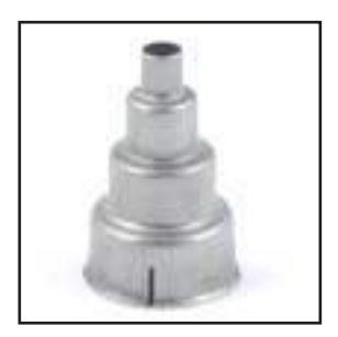
5/16" Pinpoint Attachment Pinpoint hot air source for desoldering and welding PVC Part No. 35294*