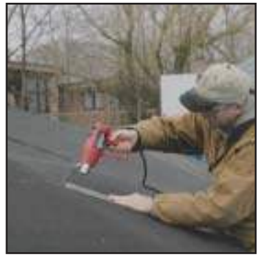
Weld Roofing Felt