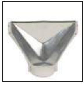
Spreader Attachment For spreading air over larger area Part No. 35016