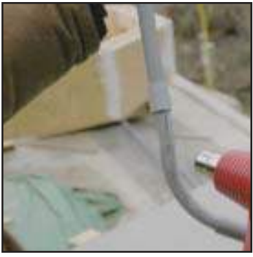
Bend Plastics and PVC