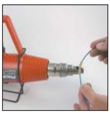
Terminate Specialty Connectors