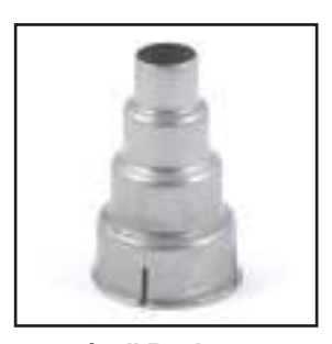
9/16" Reducer Attachment Direct hot air source for desoldering and welding PVC Part No. 35293*