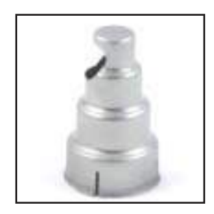
Specialty Connector Attachment For terminating tubing and specialty connectors Part No. 35292*