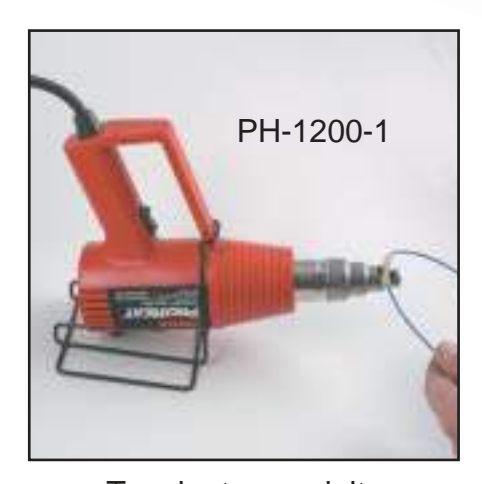
Terminate specialty connectors