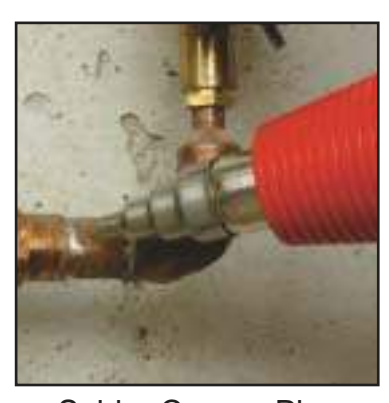
Solder Copper Pipe