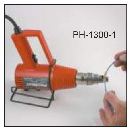
Terminate specialty connectors