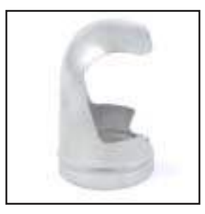
Shrink Attachment For shrink tubing Part No. 35017

Professional quality attachments and accessories add versatility to your Proheat Heat Guns.