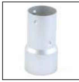
Nozzle Shield Prevents nozzle contact Part No. 35026