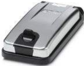
Mounting frame for one front plate/socket, frame: black, cover: metallic, closed with rotary knob.

Please be informed that the data shown in this PDF Document is generated from our Online Catalog. Please find the complete data in the user's documentation. Our General Terms of Use for Downloads are valid ( http://phoenixcontact.com/download )