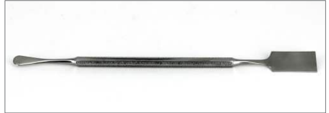
MPTSS2 Stainless steel spatula – Short rounded tip & large flat squared tip