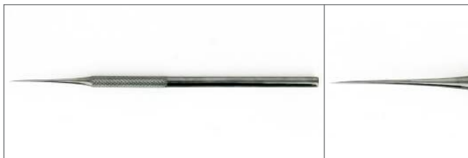
MPTSP1 Stainless steel probe - Straight needle tip