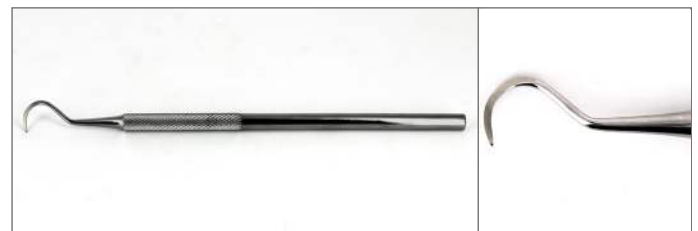
MPTSP4 Stainless steel probe - Hook tip