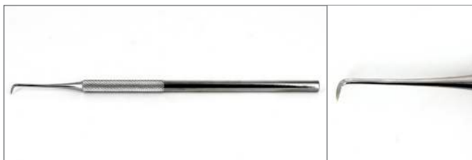
MPTSP3 Stainless steel probe - Single bend tip