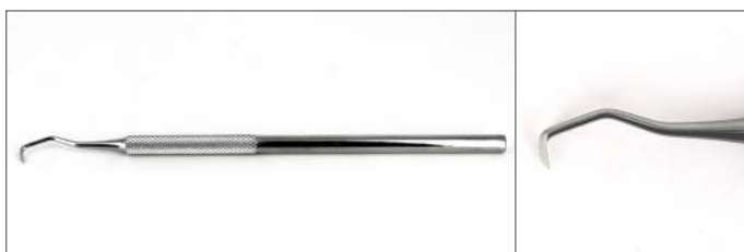
MPTSP5 Stainless steel probe - Triple bend tip