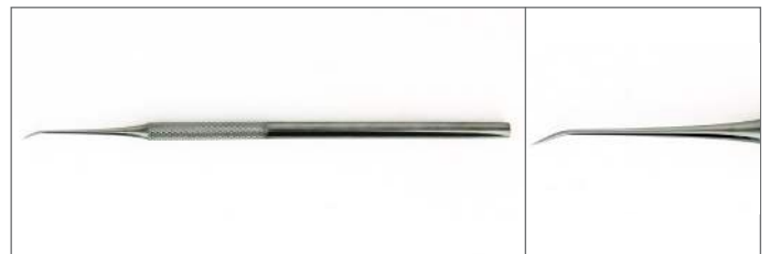
MPTSP2 Stainless steel probe - Angled needle tip