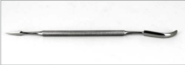
MPTSS1 Stainless steel spatula - Short pointed tip & long curved rounded tip