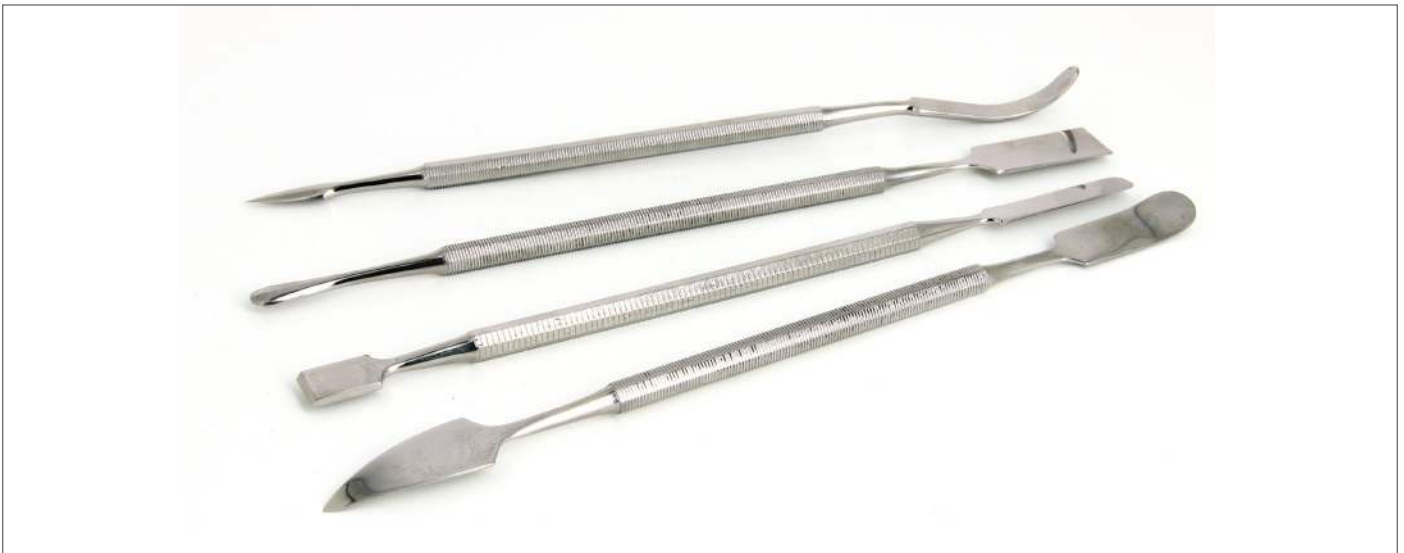
K4MPTSS Stainless steel spatulas - Kit of four styles (MPTSS1, MPTSS2, MPTSS3, MPTSS4)