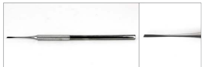
MPTSP6 Stainless steel probe - Flat tip