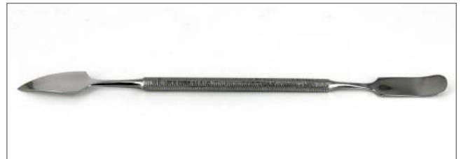
MPTSS4 Stainless steel spatula – Long curved pointed tip & long curved rounded tip