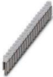
Fixed bridge, Number of positions: 20, Color: silver

Please be informed that the data shown in this PDF Document is generated from our Online Catalog. Please find the complete data in the user's documentation. Our General Terms of Use for Downloads are valid ( http://download.phoenixcontact.com )