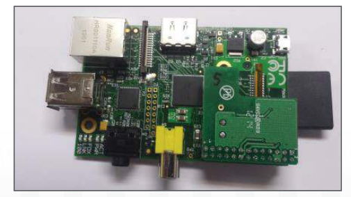
Fig. 1: R-Pi with piggy back RF-transmitter board

Install the board on to the row of pins as show in the picture and connect your Raspberry-Pi as normal to a monitor, mouse, keyboard and USB power supply.