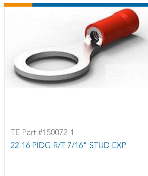
TE Part #150072-1 22-16 PIDG R/T 7/16" STUD EXP