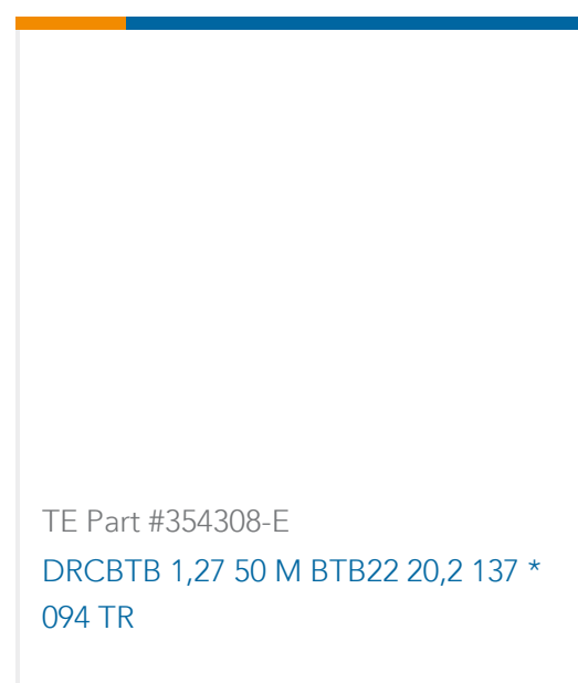
TE Part #354308-E DRCBTB 1,27 50 M BTB22 20,2 137 * 094 TR