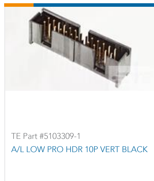
TE Part #5103309-1 A/L LOW PRO HDR 10P VERT BLACK