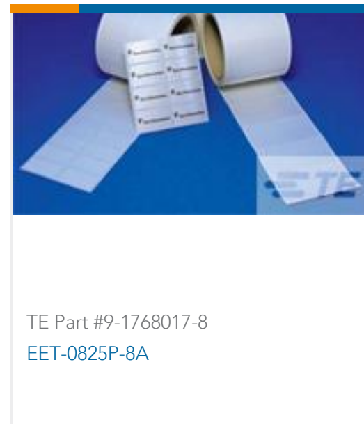
TE Part #9-1768017-8 EET-0825P-8A