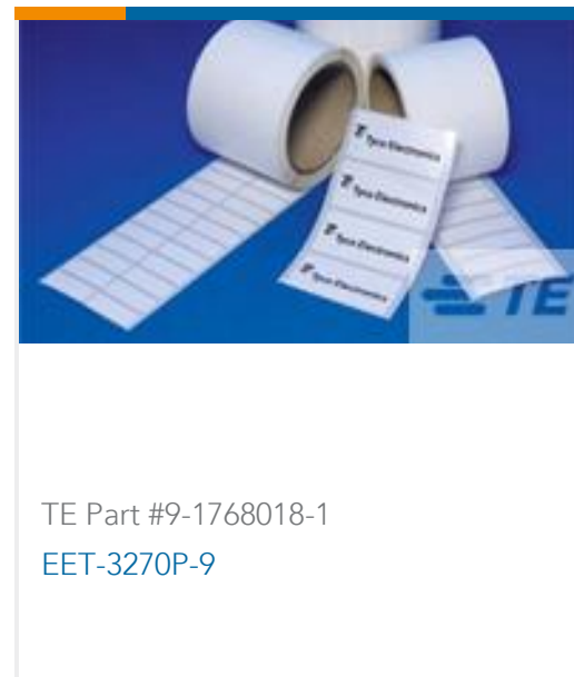
TE Part #9-1768018-1 EET-3270P-9