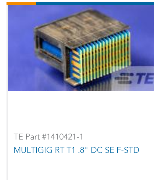
TE Part #1410421-1 MULTIGIG RT T1 .8" DC SE F-STD