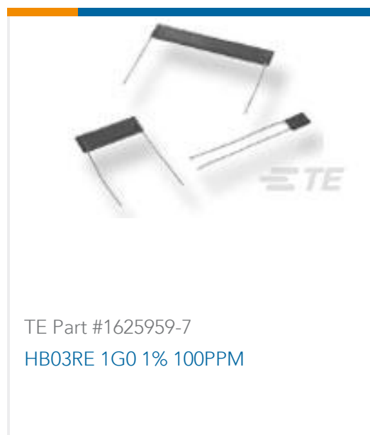
TE Part #1625959-7 HB03RE 1G0 1% 100PPM