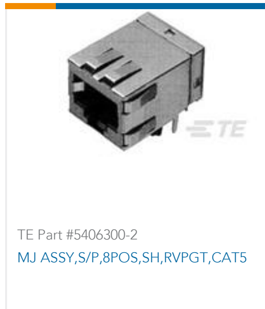
TE Part #5406300-2 MJ ASSY,S/P,8POS,SH,RVPGT,CAT5