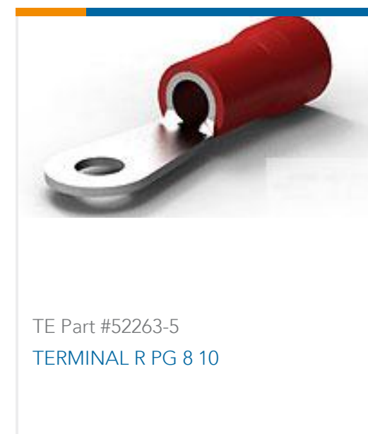
TE Part #52263-5 TERMINAL R PG 8 10