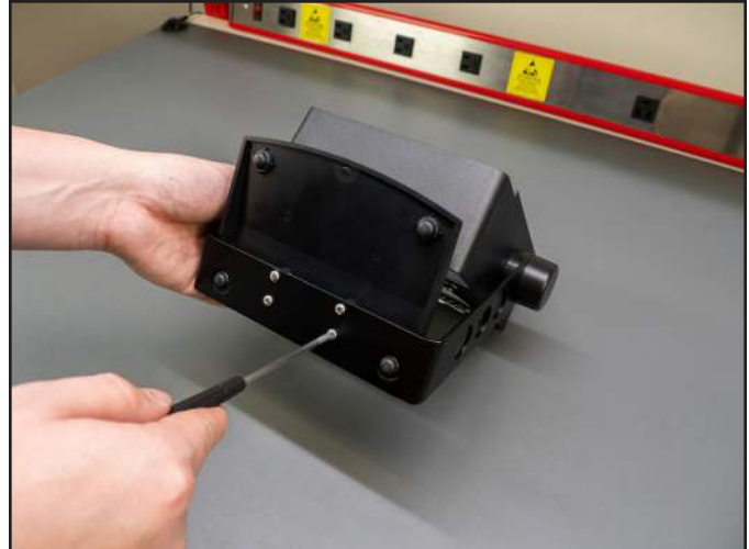
Figure 2. Removing the 4 screws underneath the 963E Benchtop Air Ionizer