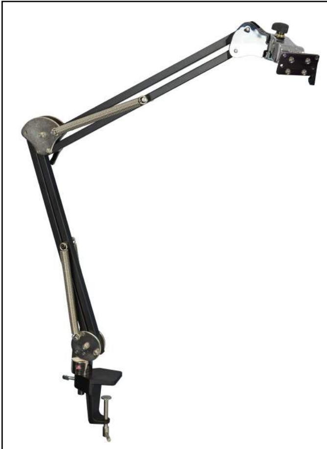
Figure 1. SCS 770047 Benchtop Ionizer Boom Arm