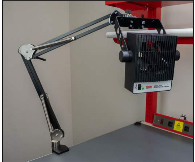
Figure 6. Using the Benchtop Ionizer Boom Arm with the 963E Benchtop Air Ionizer