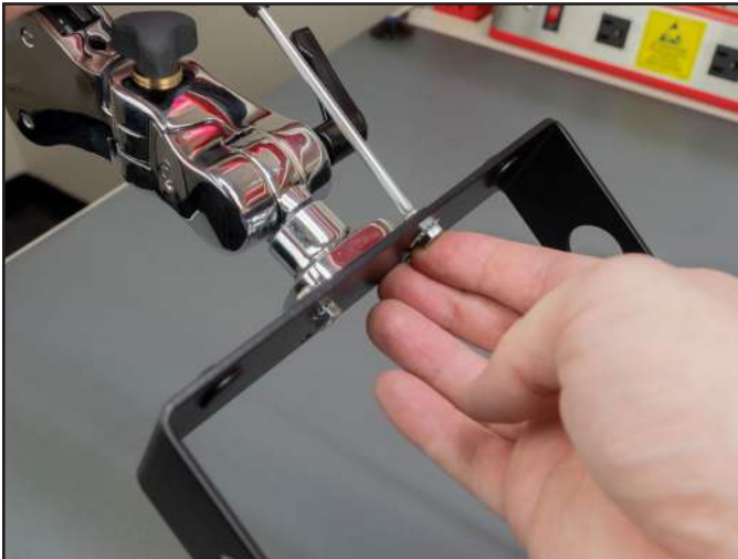
Figure 5. Securing the boom arm to 963E Benchtop Air Ionizer's metal bracket