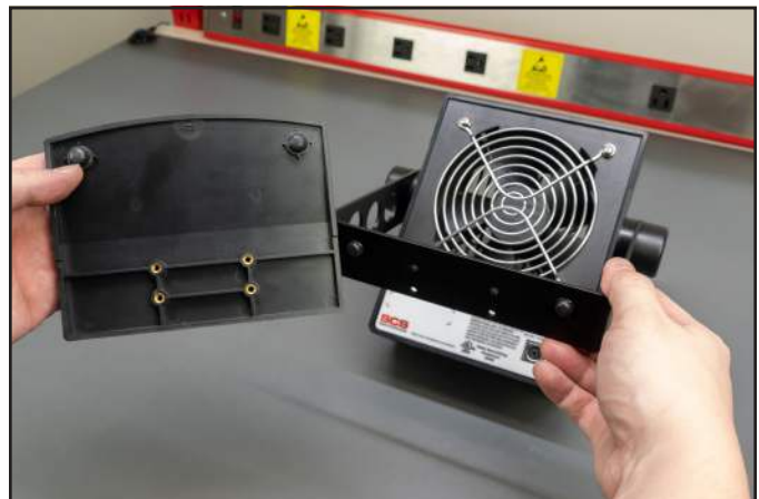
Figure 3. Removing the plastic base plate from the 963E Benchtop Air Ionizer