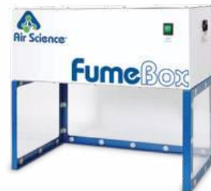
Fume Box AP60V