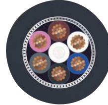
PUR halogen-free black shielded [PUR]