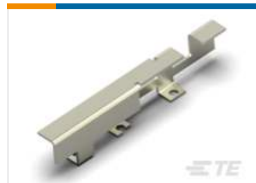
TE Part #2108517-2 DUAL BAND WiFi ANTENNA, STAMPED METAL,SMD