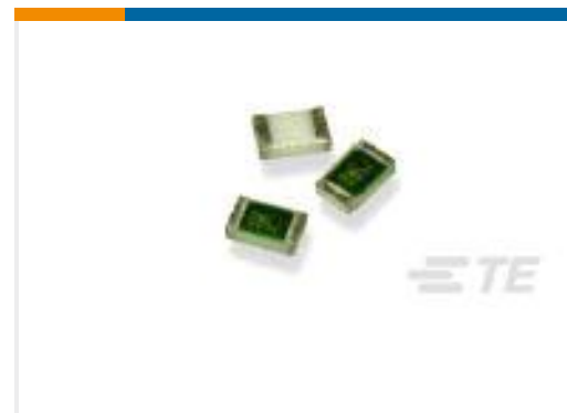
TE Part #9-1879214-0 CPF 0402 3K16 0.1% 25PPM 1K RL