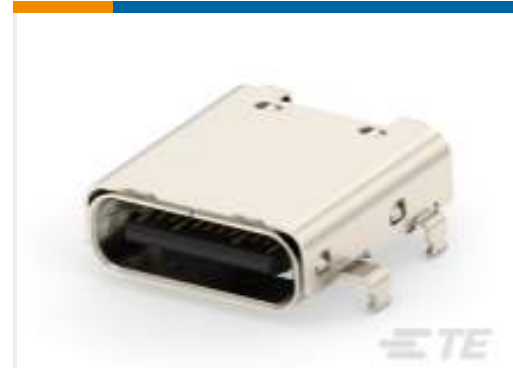
TE Part #2388749-1 USB4 RECPTACLE ON BOARD