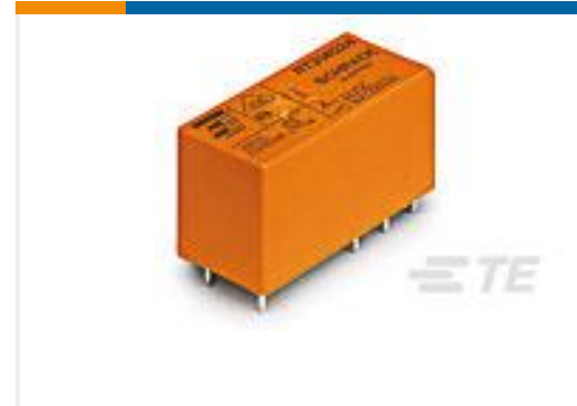
TE Part #8-1415535-6 RT314012WG