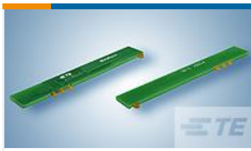
TE Part #2118310-1 4G World Band, MetaSpan, Tab Mt. PCB