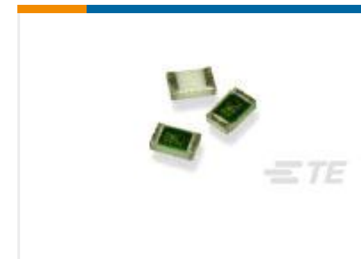
TE Part #2-1879215-7 CPF 0402 7K68 0.1% 25PPM 1K RL