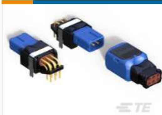
TE Part #YD369-G66-NS400000 369 6 WAY INLINE 90 PCB REC, GOLD, SKT