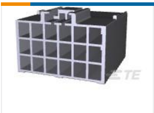
TE Part #176291-1 UNIV POWER CAP HSG 18P F/H