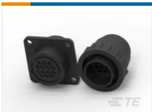
TE Part #182647-1 CPC EMEA