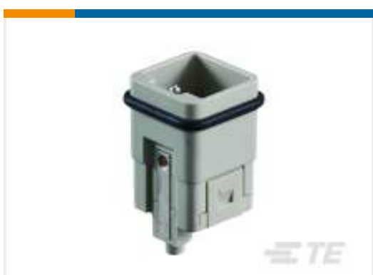
TE Part #T2080072101-000 HQ-007-M