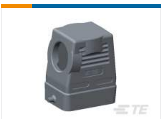
TE Part #T1330060121-000 H6B-TSH-PG21