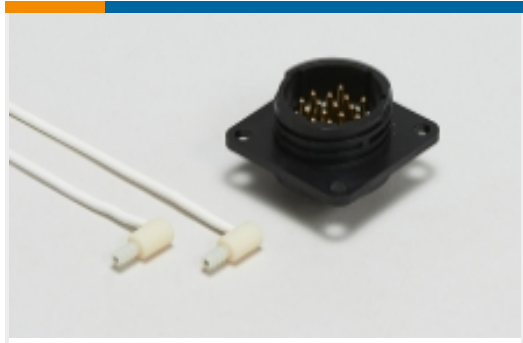
Circular Power Connectors(459)