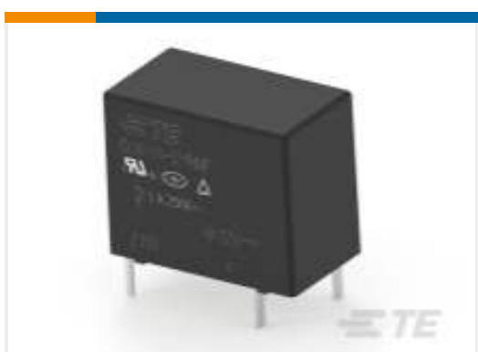
TE Part #2071556-5 OJS-SS-124HMF,00000