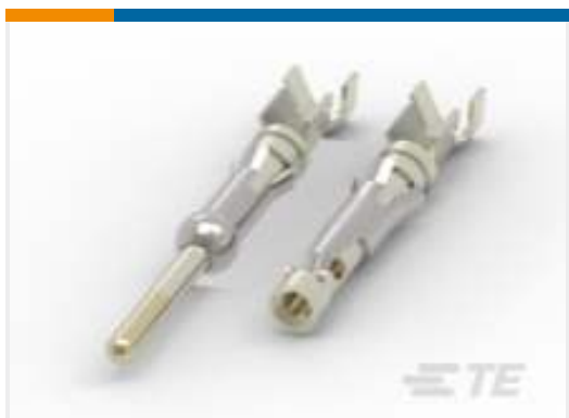
TE Part #1-66108-5 Strip Pin and Socket Contacts, Type III