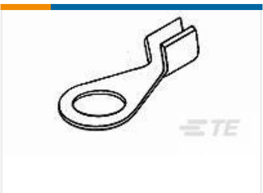
TE Part #61546-1 RING TONGUE 10-6 AWG TPCUBR