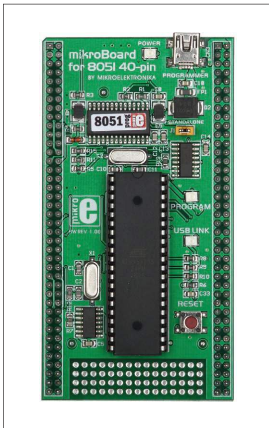
Figure 1: mikroBoard for 8051 40-pin