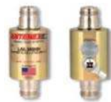
Lightning Arrestor LABH350NN (Sold Separately)