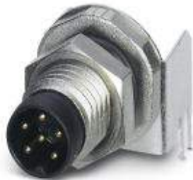
Sensor/actuator flush-type plug-in connector, plug, 6-pos., M8, rear/screw mounting with M8 fastening thread, with angled solder connection

Please be informed that the data shown in this PDF Document is generated from our Online Catalog. Please find the complete data in the user's documentation. Our General Terms of Use for Downloads are valid ( http://download.phoenixcontact.com )