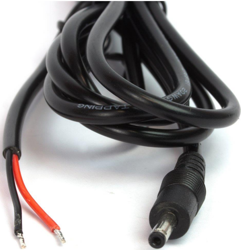
1.5m long power cable /CAB1100