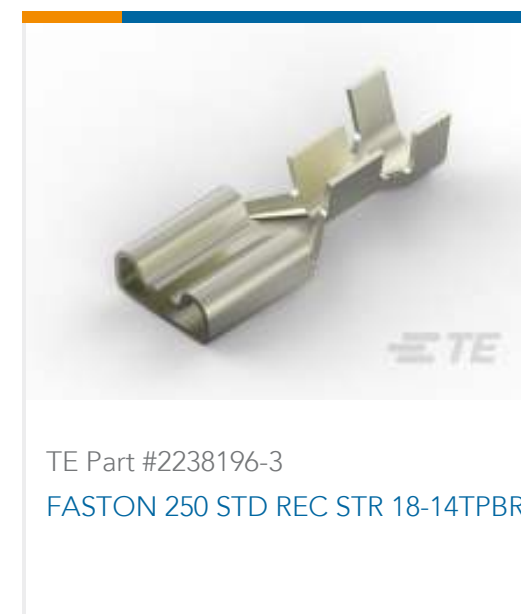
TE Part #2238196-3 FASTON 250 STD REC STR 18-14TPBR