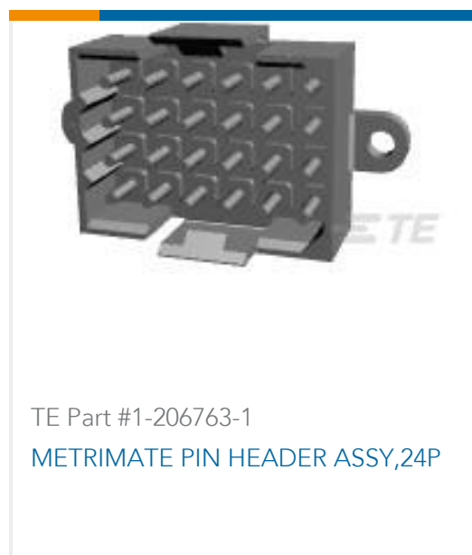
TE Part #1-206763-1 METRIMATE PIN HEADER ASSY,24P