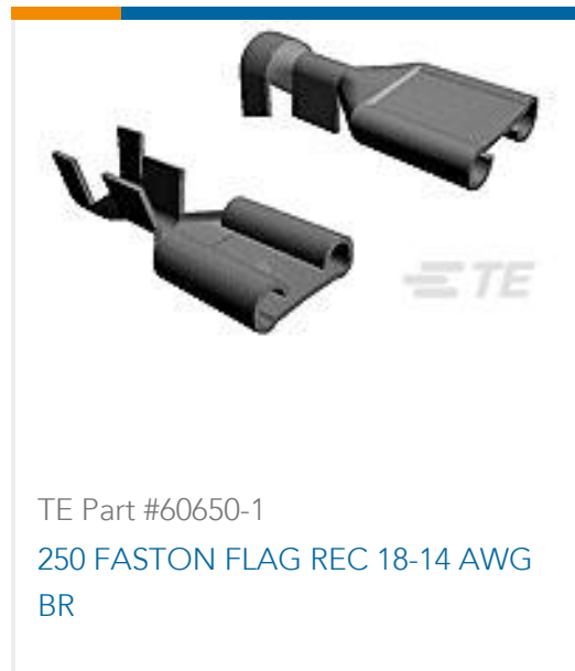
TE Part #60650-1 250 FASTON FLAG REC 18-14 AWG BR