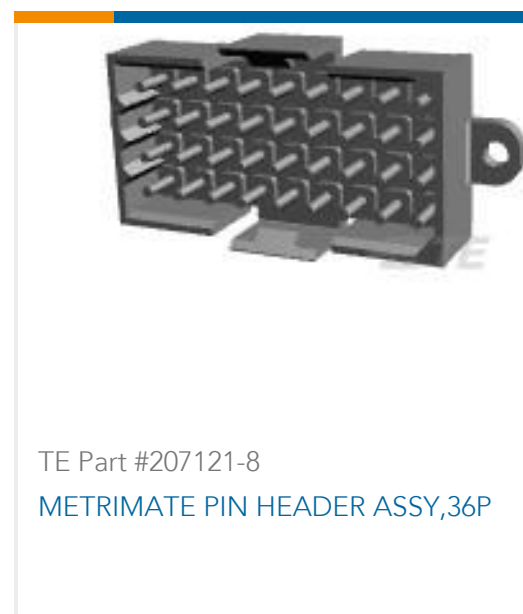
TE Part #207121-8 METRIMATE PIN HEADER ASSY,36P