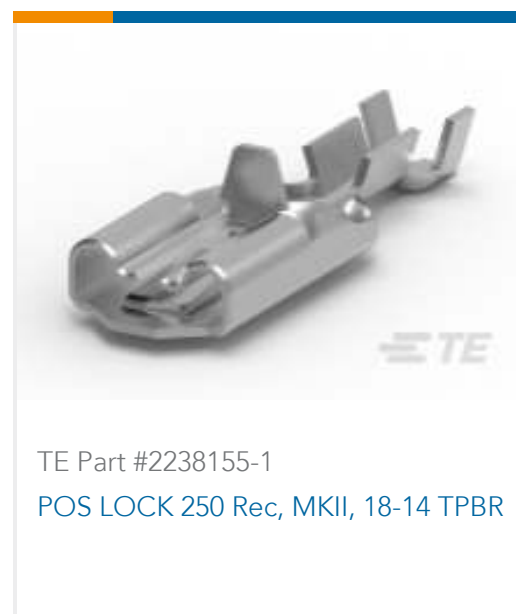
TE Part #2238155-1 POS LOCK 250 Rec, MKII, 18-14 TPBR