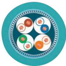
Ethernet, flexible, CAT5 [94B]