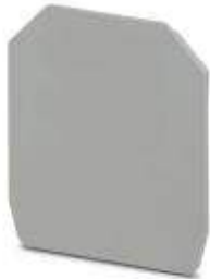
End cover, Length: 52 mm, Width: 2 mm, Color: gray

Please be informed that the data shown in this PDF Document is generated from our Online Catalog. Please find the complete data in the user's documentation. Our General Terms of Use for Downloads are valid ( http://download.phoenixcontact.com )