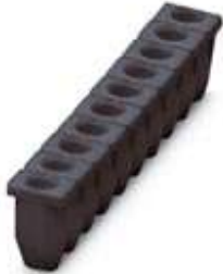
Insulating sleeve, Color: black

Please be informed that the data shown in this PDF Document is generated from our Online Catalog. Please find the complete data in the user's documentation. Our General Terms of Use for Downloads are valid ( http://phoenixcontact.com/download )