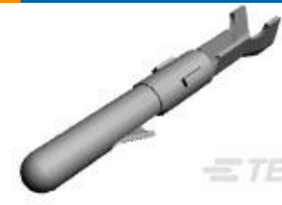
TE Part #350079-1 MNL PIN 30-22 PTPBR