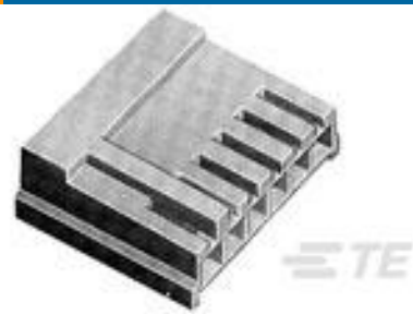
TE Part #171822-2 EIS REC. HSG 2P-NATURAL