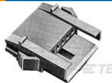
TE Part #172213-2 EIS CAP HSG PANEL MOUNT 2P NATUTURAL