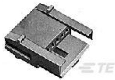
TE Part #1-172211-2 12P CAP HSG F/H EI S CONN.