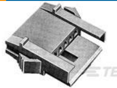
TE Part #172213-5 EIS CAP HSG PANEL MOUNT 5P NATUTURAL