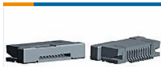
TE Part #1-1734592-0 FPC CONN. 0.5MM PITCH B/C, 10P