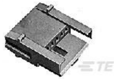
TE Part #172211-4 EIS CAP HSG FREE HANG 4P NATUTURAL