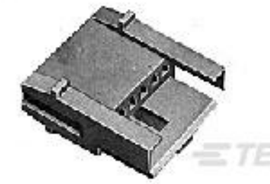
TE Part #172211-8 8P CAP HSG FREE HABG EI S CONN