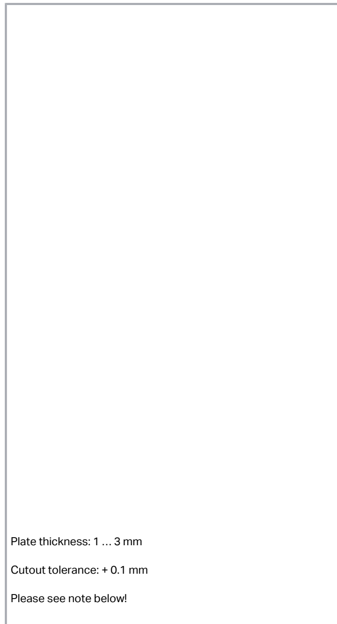
Plate thickness: 1 ... 3 mm