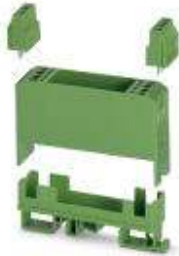
Electronic housing set, consisting of electronic housing and printed circuit termination blocks, pitch 5

Please be informed that the data shown in this PDF Document is generated from our Online Catalog. Please find the complete data in the user's documentation. Our General Terms of Use for Downloads are valid ( http://phoenixcontact.com/download )