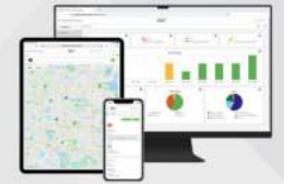
Manage this device with Digi Remote Manager