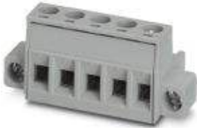
The figure shows a 5-pos. version of the product in gray

Plug component, Nominal current: 12 A, Rated voltage (III/2): 320 V, Number of positions: 19, Pitch: 5.08 mm, Connection method: Screw connection, Color: pastel green, Contact surface: Tin