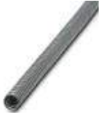
Protective hose in galvanized steel

Protective hose - WP-STEEL ZC 45 - 3240701