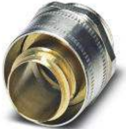
Cable gland made from brass with Pg thread, rotatable, IP40 protection

Please be informed that the data shown in this PDF Document is generated from our Online Catalog. Please find the complete data in the user's documentation. Our General Terms of Use for Downloads are valid ( http://phoenixcontact.com/download )