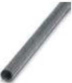
Protective hose in stainless steel

Protective hose - WP-STEEL S 45 - 3240690