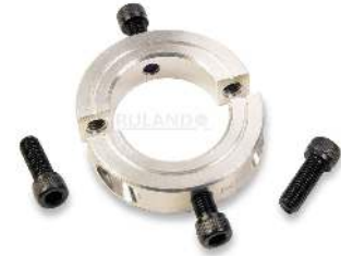
*Additional hardware NOT included