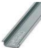
DIN rail 35 mm (NS 35)

DIN rail - NS 35/ 7,5 WH UNPERF 2000MM - 1204122