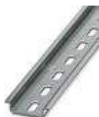
DIN rail, material: Galvanized, perforated, height 7.5 mm, width 35 mm, length: 2 m

DIN rail - NS 35/ 7,5 ZN PERF 2000MM - 1206421