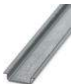
DIN rail, material: Galvanized, unperforated, height 7.5 mm, width 35 mm, length: 2 m

DIN rail - NS 35/ 7,5 ZN UNPERF 2000MM - 1206434