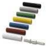
Insulating sleeve, Color: red