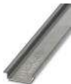
DIN rail, unperforated, Width: 35 mm, Height: 7.5 mm, Length: 2000 mm, Color: silver

DIN rail, unperforated - NS 35/ 7,5 AL UNPERF 2000MM - 0801704