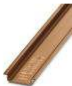
DIN rail, material: Copper, unperforated, height 7.5 mm, width 35 mm, length: 2 m

DIN rail - NS 35/ 7,5 CU UNPERF 2000MM - 0801762