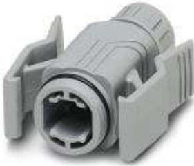
RJ45 sleeve housing, IP67, for pin insert VS-08-ST-H11-RJ45 and VS-08-ST-H21-RJ45, with push-pull interlocking for panel mounting frames, for cable cross section 5.0 mm ... 8.5 mm, color: gray

Please be informed that the data shown in this PDF Document is generated from our Online Catalog. Please find the complete data in the user's documentation. Our General Terms of Use for Downloads are valid ( http://download.phoenixcontact.com )