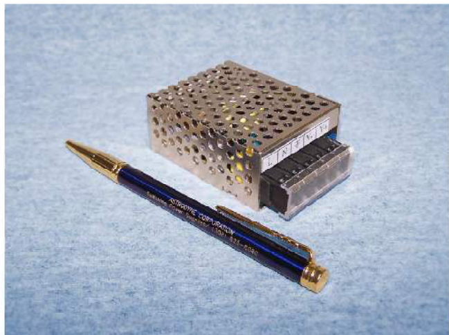
2.59"W x 2.0"L x 1.1"H