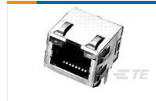
TE Part #6116075-1 INV MJ,1X1,SHIELDED,LED (G/Y)