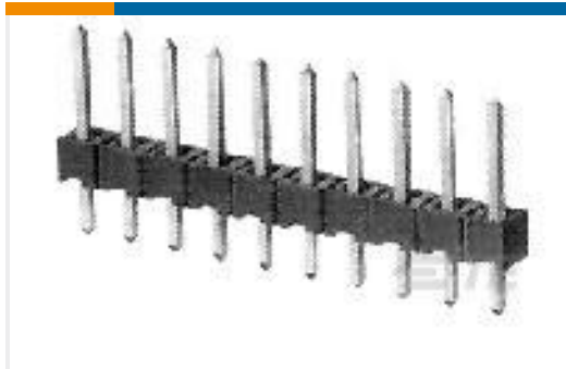
TE Part #2-826629-0 20P AMPMODU II PIN HDR