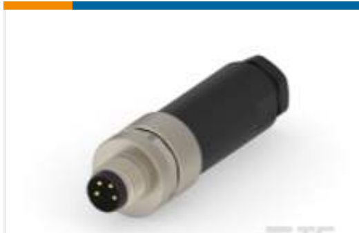
TE Part #T4011008041-000 M8,SCREW, MALE,S,UNSHIELD,4P, GOLD