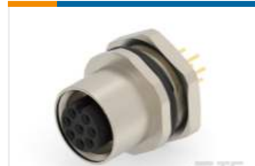
TE Part #T4143012081-000 M12,FRONT MOUNT,FEMALE,A,8P, SOLDER PCB