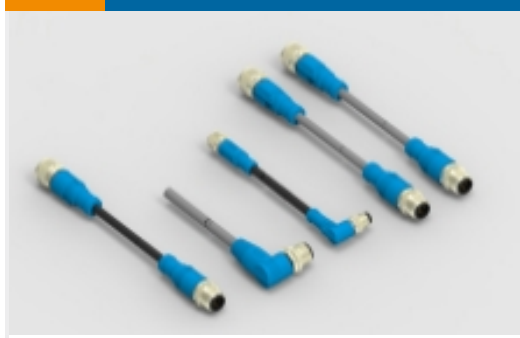
M8/M12 Cable Assemblies(147)