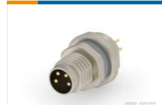
TE Part #T4040014041-000 M8.MLE.PNLREAR.4POS.STR PCB