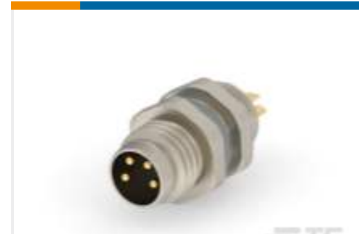
TE Part #T4032014041-000 M8.MLE.PNLFRONT.4POS.STR.