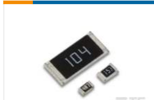
TE Part #3-2176337-4 CRGCQ 0402 5K6 1%