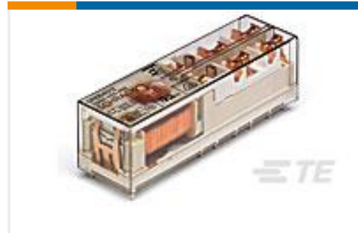
TE Part #6-1415537-5 SR6A6K24