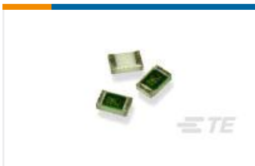
TE Part #4-1614894-9 CPF 0805 576K 0.1% 25PPM 1K RL